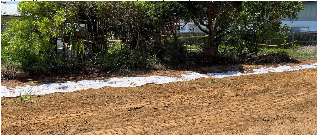
Excavation along the northern boundary required the removal of the boundary fence. Surface materials to natural ground were scrapped to approximately 0.1 m north of the Site boundary marked by the red tape.