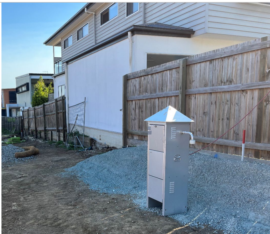
Eastern Boundary Fence with boundary fence. Imported material was place along the boundary fence following excavation and validation.