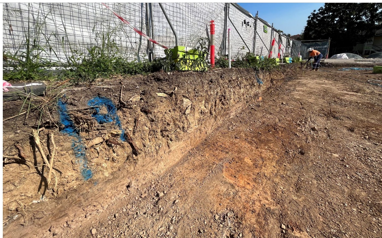
Excavation along the western boundary of the Site. The survey peg shown is offset 0.5 m west off the Site boundary.