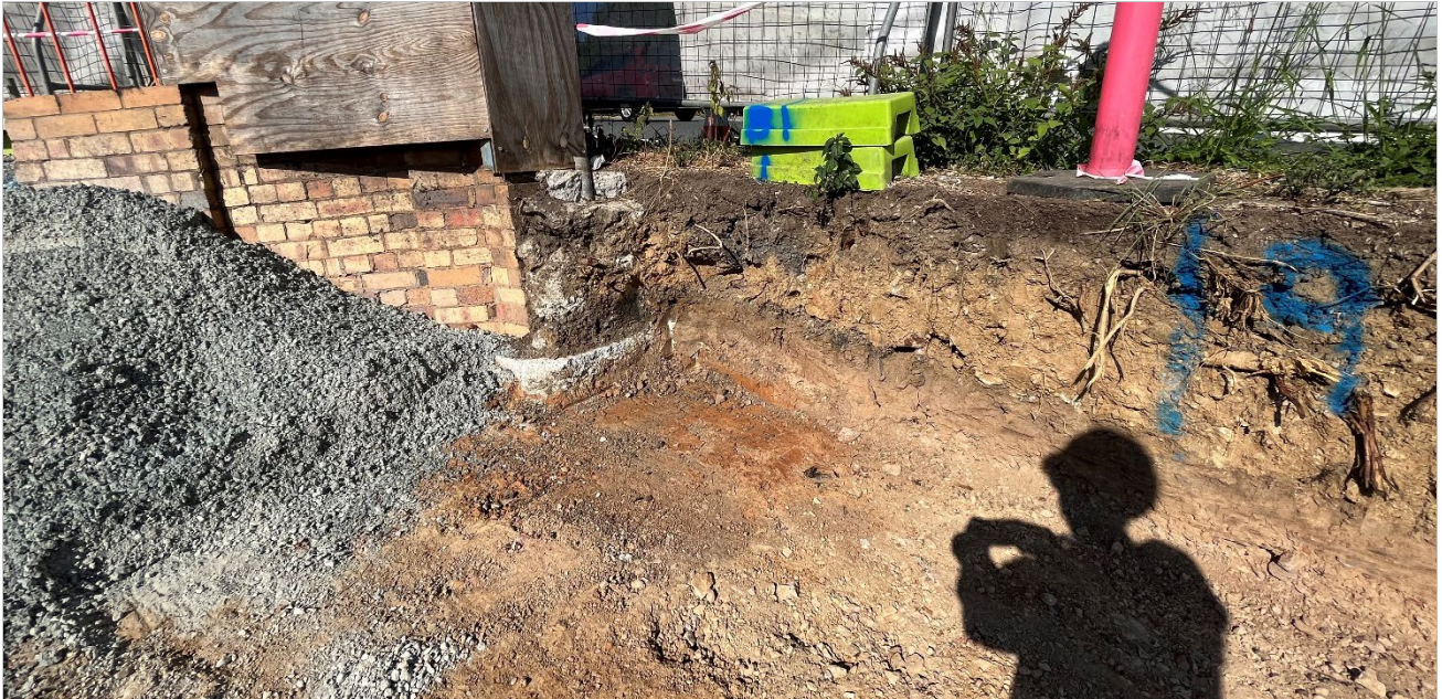
Excavation along the south western boundary of the Site with the footings of the heritage wall exposed. The footings of the heritage wall extended to natural ground