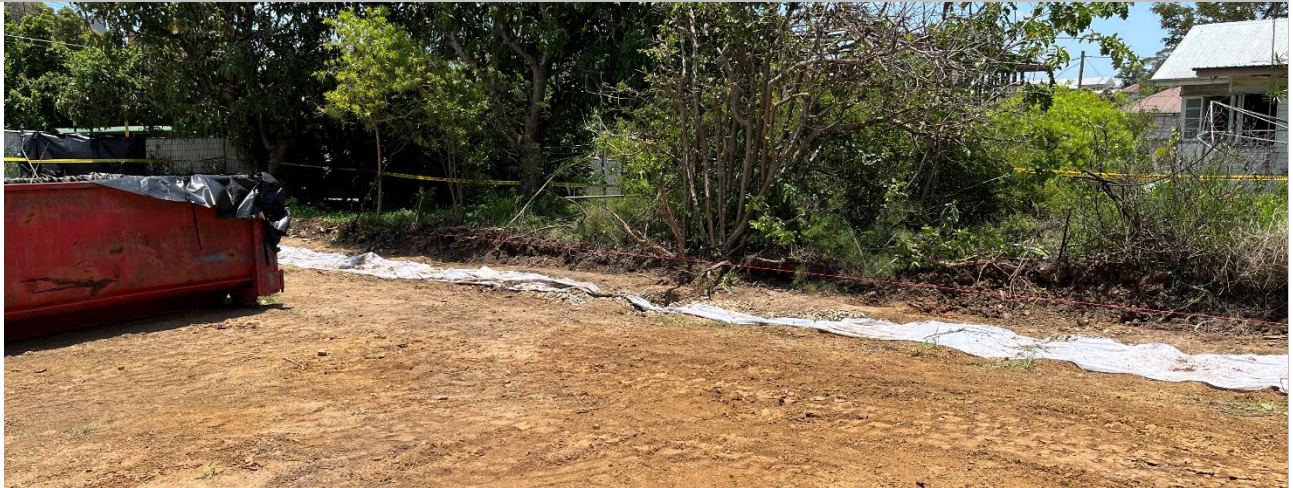
Excavation along the northern boundary required the removal of the boundary fence. Surface materials to natural ground were scrapped to approximately 0.1 m north of the Site boundary marked by the red tape.