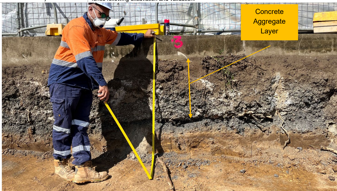
Excavation along the southern boundary was undertaken to the retaining wall which was the practicable limit of excavation.