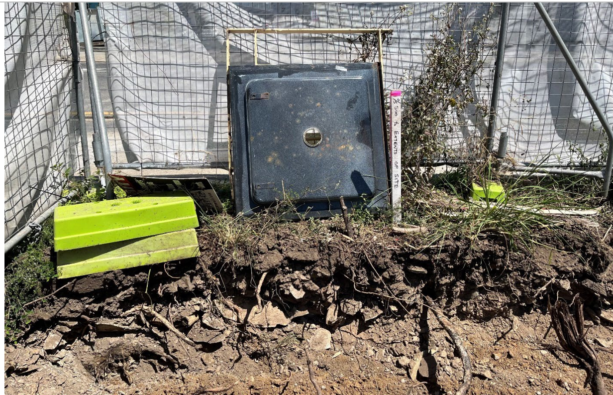
Excavation along the western boundary of the Site. The survey peg shown is offset 0.5 m west off the Site boundary.