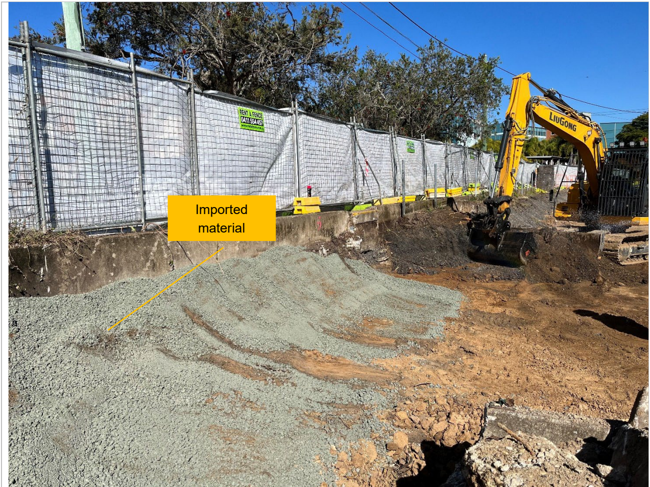
Excavation along the southern boundary. Imported material was placed against wall following excavation and collection of validation samples.