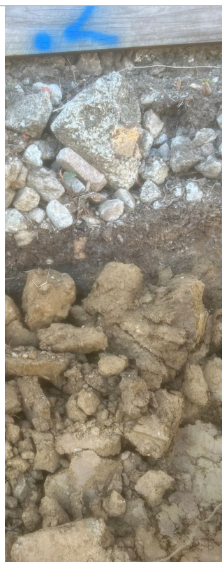
Example of excavation to Eastern Boundary Fence